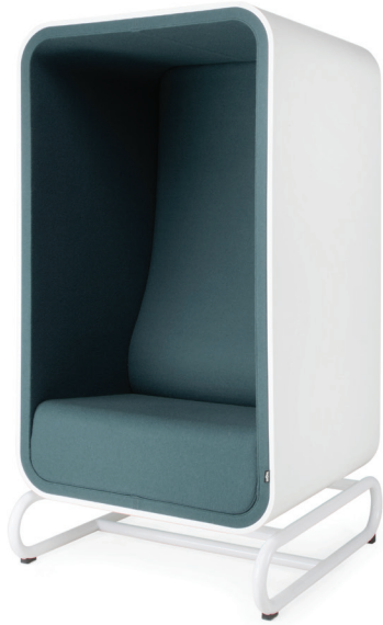
201M METAL BASE