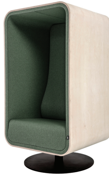
201S SWIVEL BASE