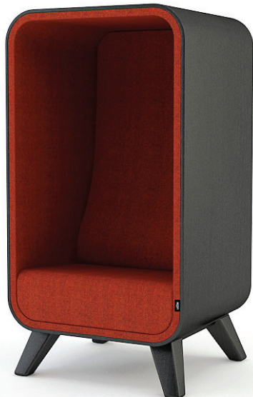
201W WOODEN BASE