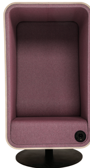
201S W/ POWER SOCKET